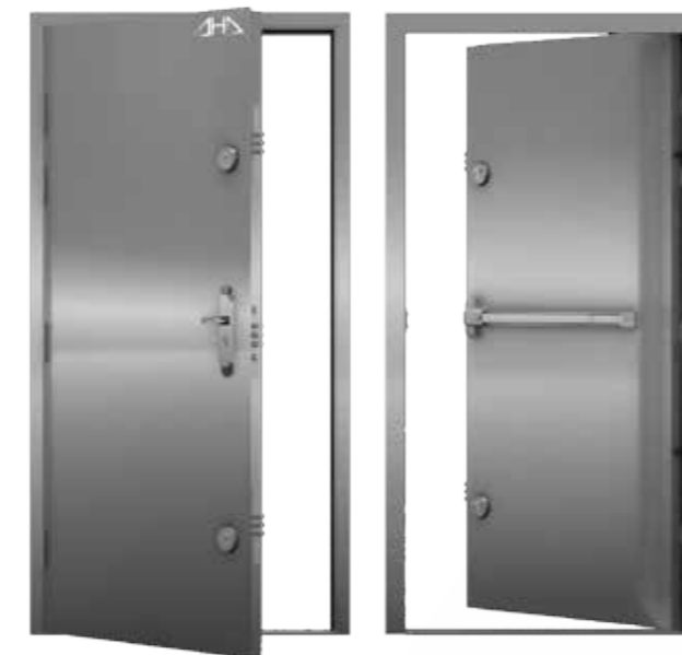
Security Door AHD-SD-SS68