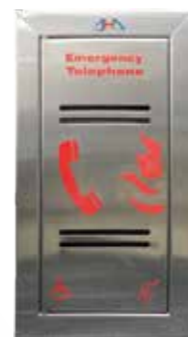
Telephone Box - AHD-SP-43