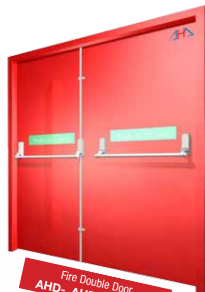
Fire Double Door AHD- AHD-FD-MS66