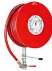
Fire Hose Reel Fire Hose - AHD-FF46