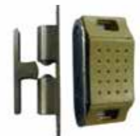
Ball catcher or Magnetic catcher - AHD-FF55