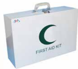
First Aid Kit - AHD-SP-41