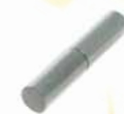
SS Pin hinges -AHD-FF58