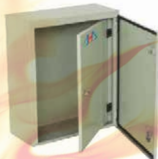
Electrical Box - AHD-SP-44