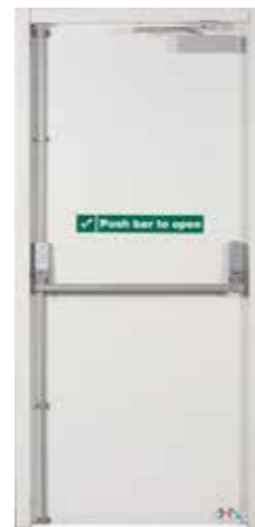
Panic Bolt-Vision Panel AHD-FD-MS63