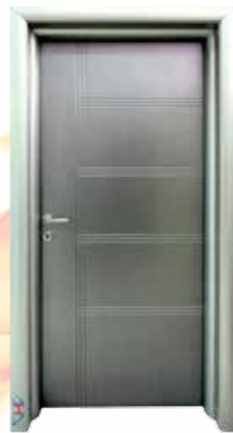
Stainless Steel Decorative AHD-FD-SS60