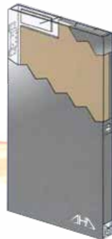
Acoustic Door Construction STC-42DP AHD-FD-SS65