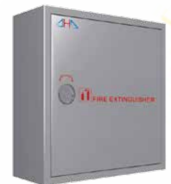
Stainless Steel - AHD-FEX-SS-S32