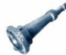
Nozzle - AHD-FF48