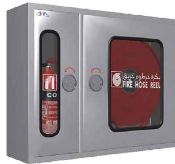
Stainless Steel Cabinet - AHD-D-SS-S01