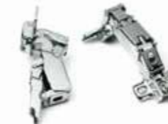
Furniture hinges (Concealed hinges) - AHD-FF57