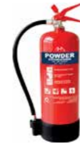
Fire Extinguisher Dry Powder - AHD-FF50