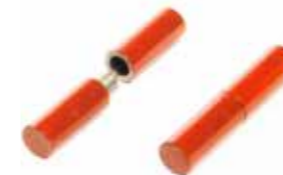
Push pin hinges - AHD-FF56