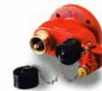
Breaching inlet - AHD-FF47