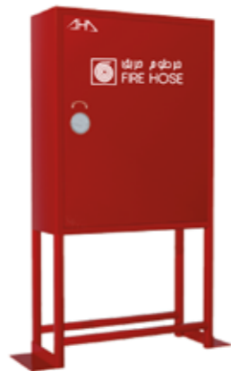
Self Stand - AHD-SP-42