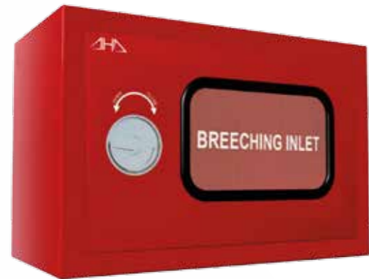
Mild Steel 2-way - AHD-BI-MS-S21