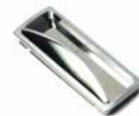
Recessed pull handle - AHD-FF52