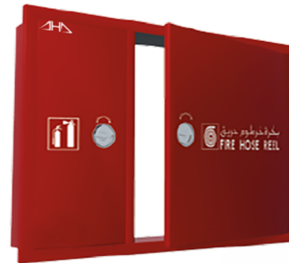
Door & Architrave - AHD-D-MS-R02