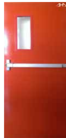
Push Bar-Vision Panel AHD-FD-MS62