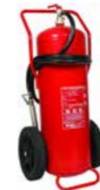
Fire Extinguisher Trolley Type - AHD-FF49