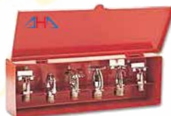
Sprinkler Box - AHD-SP-45