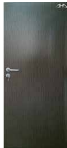
Wood Finish Acoustic Door Solid AHD-FD-MS61