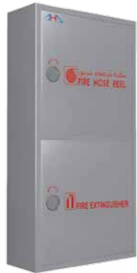
Stainless Steel Cabinet - AHD-D-SS-S07

-Stainless Steel -Piano or Concealed Hinges -Chrom Plated Round Handle -Thickness: 0.9 up to 2.0mm 304- or 316 Brush finish Available in 304 or 316 Mirror finish To accommodate 1" x 30 Meter or ¾ " x 30 Meter Fire Hose Reel, and Fire Extinguisher , Landing Valve