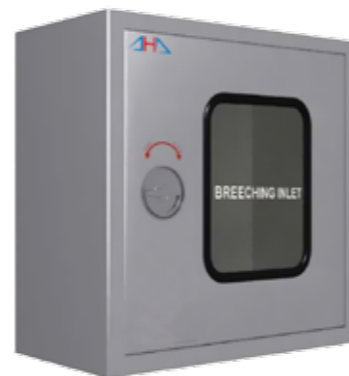
Stainless Steel 4-way AHD-BI-SS24