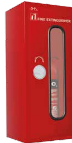
Mild Steel - AHD-FEX-MS-S29