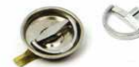
SS Round lock - AHD-FF53