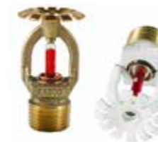
Sprinklers - AHD-FF51