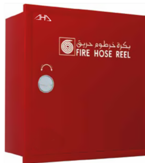
Recessed Type - AHD-S-MS-R16

-Galvanized Steel -Pin or Piano Hinges -Chrom Plated Round Handle -Thickness: 0.9 up to 2.0mm -Powder Coated RAL 3000 Texture 6-mm Wire Glass To accommodate 1" x 30 Meter or ¾ " x 30 Meter Fire Hose Reel