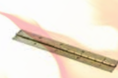
Piano Hinges - AHD-FF59