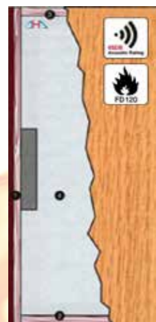
Acoustic Door Construction STC-42DP AHD-FD-MS64