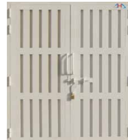
Louver Door AHD-FD-SS67