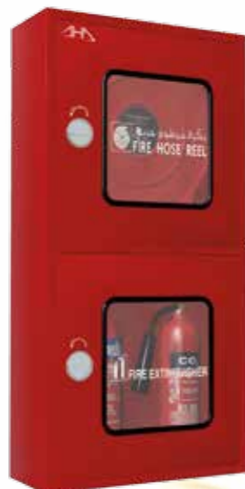
Double Door Cabinet - AHD-D-MS-S08

-Galvanized Steel -Pin or Piano Hinges -Chrom Plated Round Handle -Thickness: 0.9 up to 2.0mm -Powder Coated RAL 3000 Texture 6-mm Wire Glass To accommodate 1" x 30 Meter or ¾ " x 30 Meter Fire Hose Reel, and Fire Extinguisher , Landing Valve