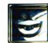
SS Square lock - AHD-FF54