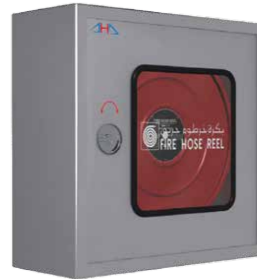
Stainless Steel Cabinet - AHD-S-SS-S15

-Stainless Steel -Piano or Concealed Hinges -Chrom Plated Round Handle -Thickness: 0.9 up to 2.0mm 304- or 316 Brush finish 6-mm Wire Glass Available in 304 or 316 Mirror finish To accommodate 1" x 30 Meter or ¾ " x 30 Meter Fire Hose Reel